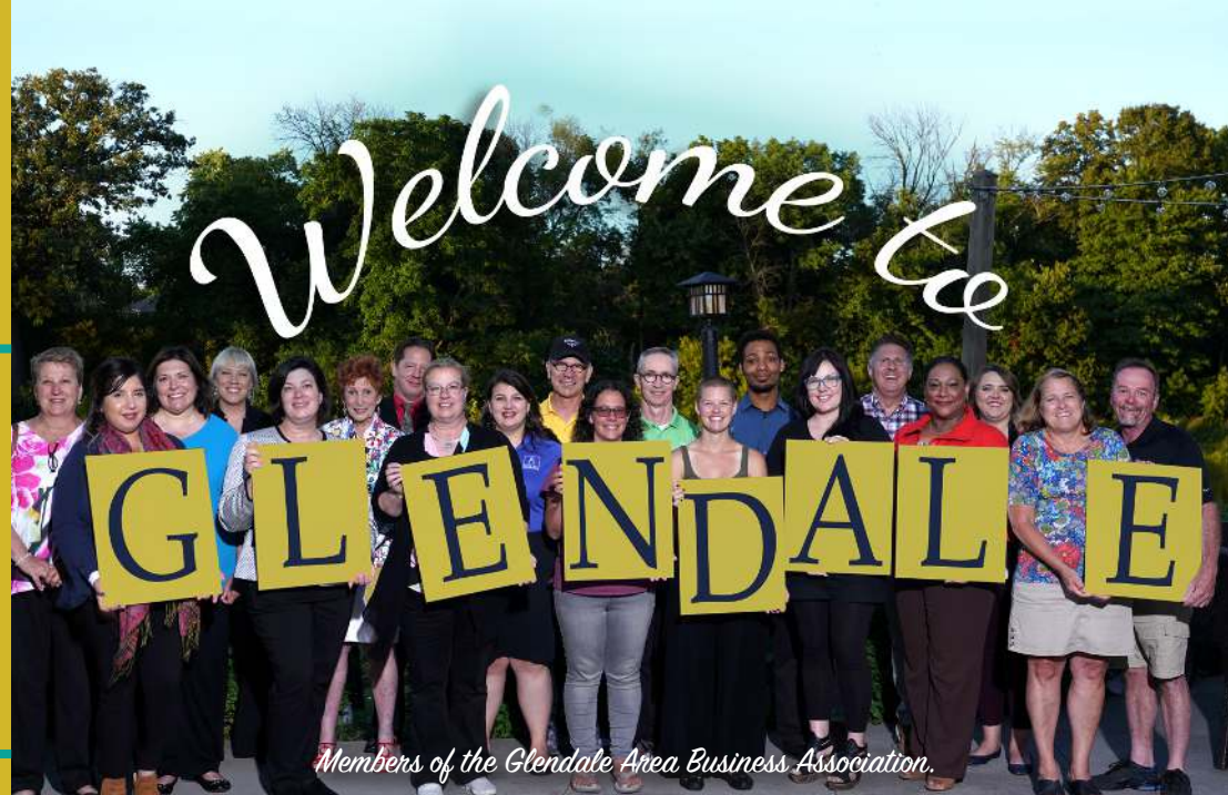
Members of the Glendale Area Business Association.